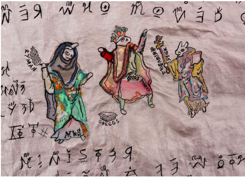
Detail from 'A Manual of Rabbrexit'