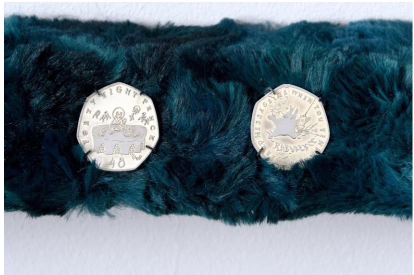
Rabbrexit 48 and 52 pence pieces