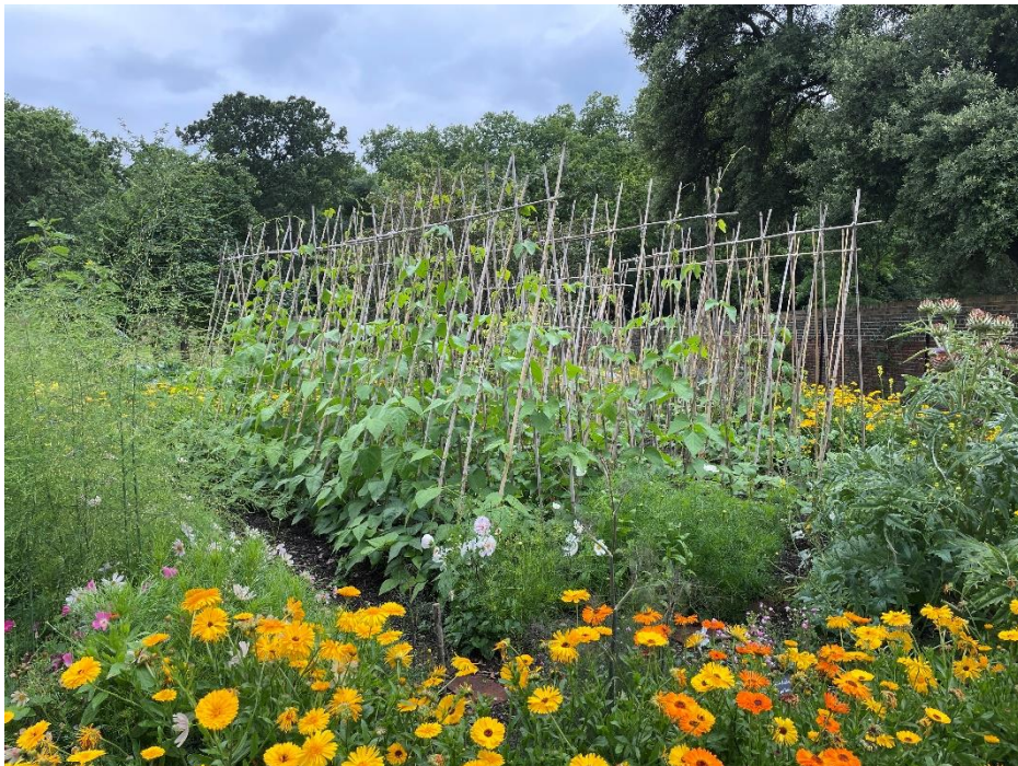
The beans on 15 July

the horticultural knowledge to confidently instruct both our regular volunteers and the occasional large groups of corporate volunteers. And the friendships! I have been here long enough to establish good relationships with lots of volunteers (not to mention my lovely and brilliant colleagues), often times the conversation naturally flowing whilst working side by side planting, potting on or mulching. I think one of the powers of gardening is that the joy of it, the pleasure of plants, the beauty of them and of tending to something and watching it grow, brings people together. Whilst working alongside someone you may have never met otherwise, you find mutual ground, either through conversation, completing a challenge together, or just working quietly side by side.