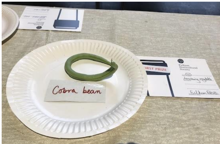
The most amusing vegetable at the FHS show!

It's a real shame Penny hasn't been here to see the beans in their full glory. And what glory! On several days, we were harvesting more than 3 kilos of beans! I have so enjoyed the big bean adventure – being introduced to all these different varieties, admiring the subtle beauty and difference of all the legume flowers I have grown this year, and was totally chuffed to receive first prize at the 100 th Fulham Horticultural Society show. We managed to get a total of 5 first prizes (congratulations to my fellow apprentices Polina and India too!) including the coveted “most amusing vegetable”, for which we submitted a French bean that looked like a hissing snake (I am assured it wasn't the only submission in its class!)