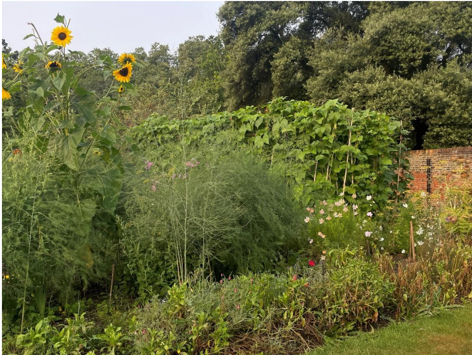
The bean bed at the end of August