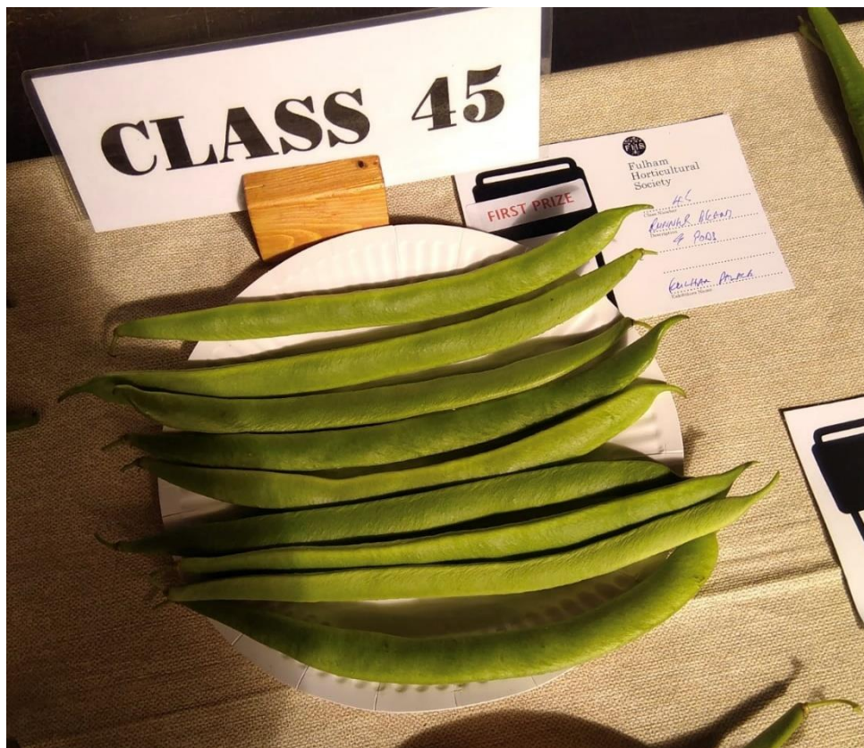
My prize winning runner beans at the 100 th Fulham Horticultural Society show