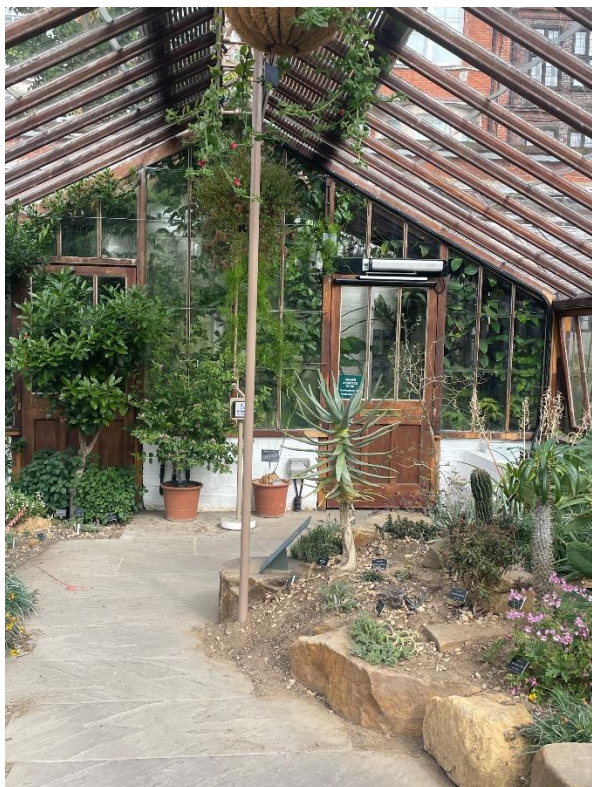
The South African Glasshouse at CPG

Some sad news however. At the end of July, our beloved cat Edmund took himself off to quietly fall asleep somewhere, and we must assume he never woke up. It has been a challenging, if not heartbreaking, time here in the gardens, and for cat lovers, of whom there seem to be many here at the Palace. He was such a sweet gentle old man, and I so enjoyed his quiet presence, accompanying me on many solo seed sowing afternoons, peacefully asleep nearby.